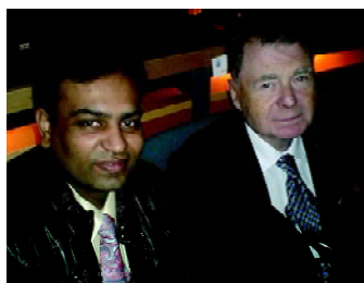
Our VC with Dr. Richard F. Heck, (Nobel Laureate), Univ. of Delaware, USA