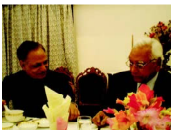
Our Chairman with Dr. AR Kidwai, the then Governor of Haryana & Delhi