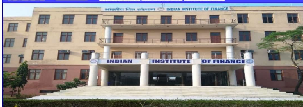
Snapshot taken on February 2nd, 2021