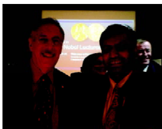
Our VC with Prof. Peter A. Diamond, (Nobel Laureate), MIT, USA