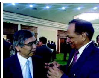
Our Chairman with Dr. Haruhiko Kuroda, President, Asian Dev. Bank (ADB)